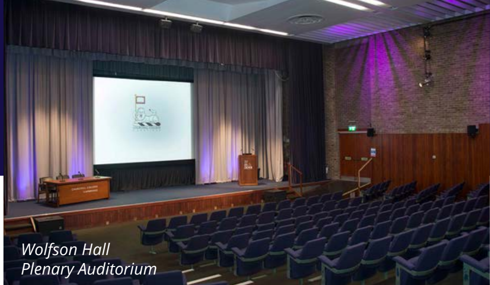
Wolfson Hall Plenary Auditorium

Conference attendees will attend a drinks reception and three-course dinner in the College on the evening of Monday, 1st July, a networking opportunity also open to Silver and Gold level sponsors.